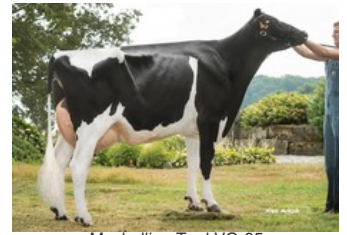
Maybelline Tual VG-85