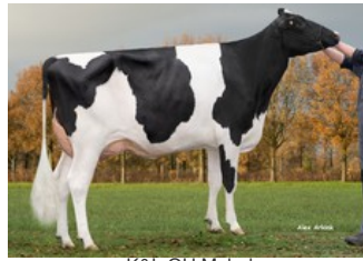
K&L OH Mabel