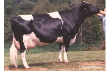
Jeta Commotion Cupid-ET VG-88

GP-84 AltaZazzle x Kenobi x Granite x VG-85 Rubicon x GP-84 Cashcoin x VG-86 Man-O-Man x VG-86 Shottle x GP-84 Finley x Brett x Lantz