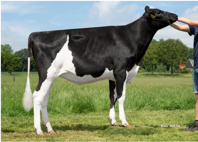
K&L OH Mallory