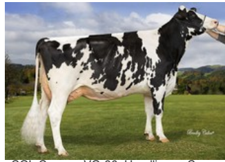
COL Carmen VG-86, Headliner x Cosmo