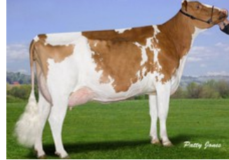
Misty Springs MB Brighter Red VG-87