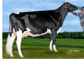
Misty Springs MOM Brenna RDC VG-86