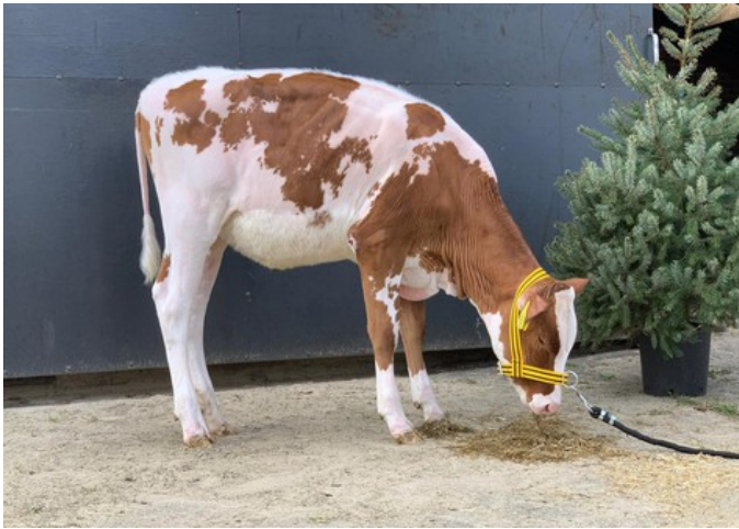
Visstein 3STAR Ardiana Red