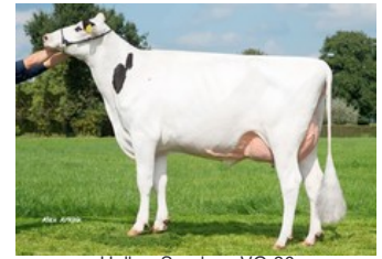
Holbra Sandoya VG-86