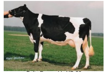
Delta Esmeralda VG-86