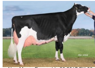
New Moore Esmeralda 38 2017 EX-93