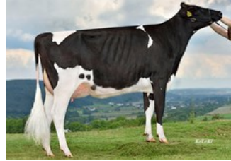
Vekis Sudan Mellow VG-88