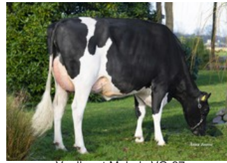
Veelhorst Melody VG-87