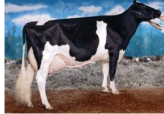
Lylehaven Form Laura EX-94