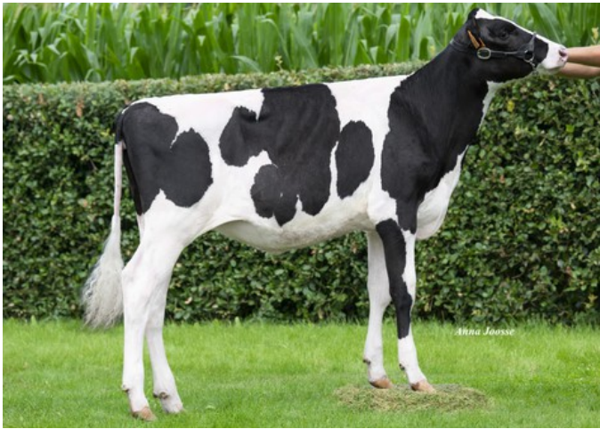
Zwanebloem Solution Shine (Solution) BE234261927