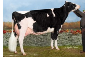
BVK Atwood Arianna EX-94

VG-89 Warrior-Red x Jordy-Red x VG-89 Archrival x VG-85 Doorman x EX-94 Atwood x EX-94 Skychief x EX-94 Starbuck x Sheik