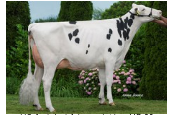
HC Archrival Arianne 1st lac. VG-89