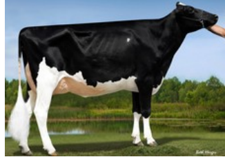
MS Ariannas Door Armani VG-85