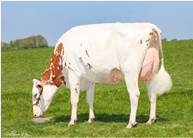
Rocca 3STAR Adna VG-89