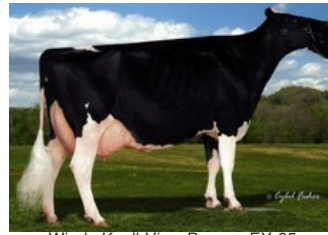
Windy-Knoll-View Pammy EX-95