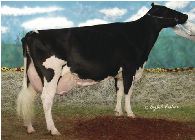
Windy-Knoll-View Promis EX-95