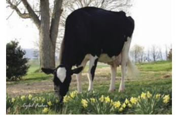
Windy-Knoll-View Promis EX-95

VG-87 Challenger x GP-83 Gymnast x EX-90 Pepper x EX-90 Numero Uno x VG-87 Baxter x EX-95 Durham x EX-95 Rudolph x EX-94 Ultimate x VG-88 Lester