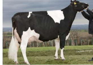
Willsbro Baxter Pammy VG-87