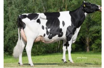
Broekhuis RUW Elite VG-86

GP-83 Vh Crown x VG-87 Cameron x VG-86 Barclay x Molotov x GP-83 Shamrock x VG-85 Man-O-Man x VG-88 Colby x VG-87 Augustine x VG-85 Ramos x VG-88 Manfred