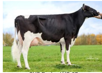
SHS England VG-87