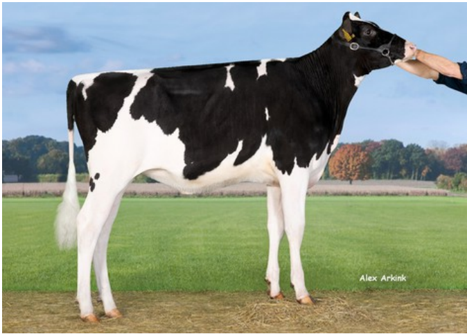
SHS Electra GP-83