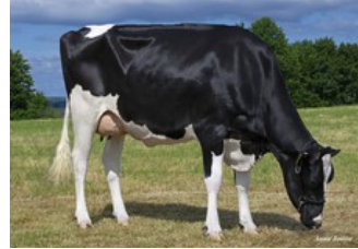
SHS England VG-87