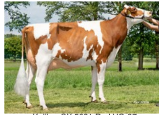
Kalibra SX 5631 Red VG-87