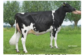
Wilder Kalibra RDC VG-88