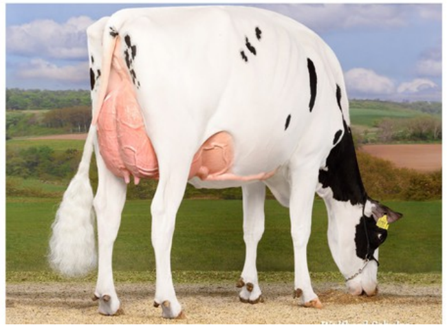
PR Darlina EX-90

VG-89 Artist x EX-90 Spark x EX-90 Mogul x EX-90 Snowman x EX-91 Goldwyn x VG-89 Shottle x VG-88 BW Marshall x VG-87 Jolt x VG-86 Bell Elton x EX-95 Chief Mark