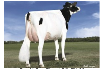
Des-Y-Gen Planet Silk EX-90