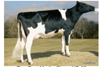
Pine-Tree Martha Sheen VG-86