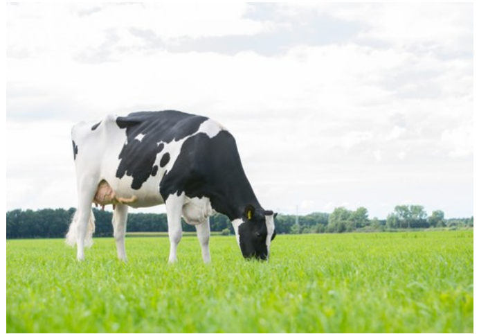
KHE I'm Good VG-87

Durable x VG-87 Gymnast x VG-87 Rubicon x VG-89 Shotglass x VG-88 Windbrook x VG-88 Jeeves x VG-85 Goldwyn x VG-85 Juror Ford x VG-85 Cleo x VG-89 Aerostar