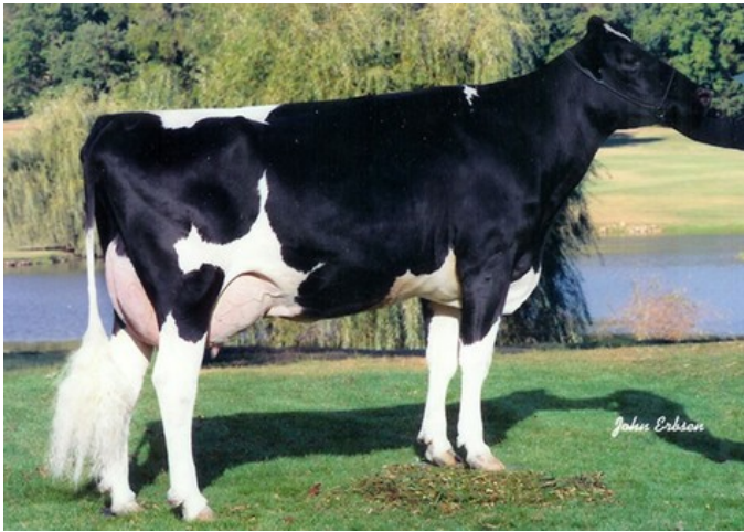
Regancrest Debbie-Jo EX-92