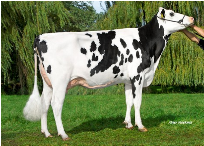
Caudumer Ebony 2 VG-88