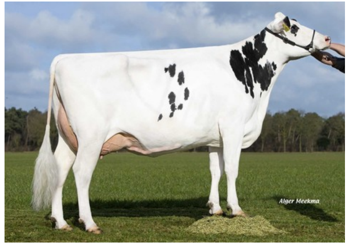
Zandenburg Snowman Ebony 1 EX-90

VG-86 Jacuzzi-Red x VG-88 Finder x Boss x EX-90 Snowman x EX-90 Twister x VG-86 Goldwyn x VG-86 Lancelot x VG-87 Webster x VG-89 Lucky Leo x VG-86 Bellwood