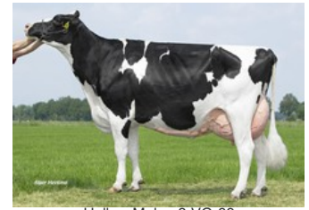
Holbra Malon 3 VG-88