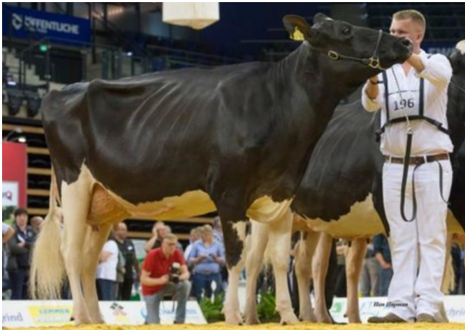
NH HS Marilyn Monroe VG-86