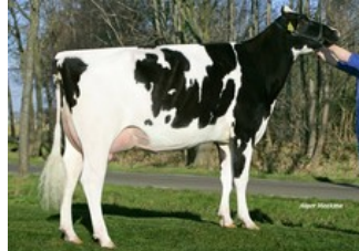
Vekis Xaco Melody VG-87