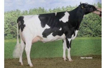
Caps Mairy 4 VG-85

VG-85 Joplin x VG-86 Balisto x VG-88 Sudan x VG-87 Xacobeo x VG-85 Goldwyn x VG-85 O Man x VG-87 Durham x GP-83 Fred x VG-86 Mascot x VG-87 Cleitus