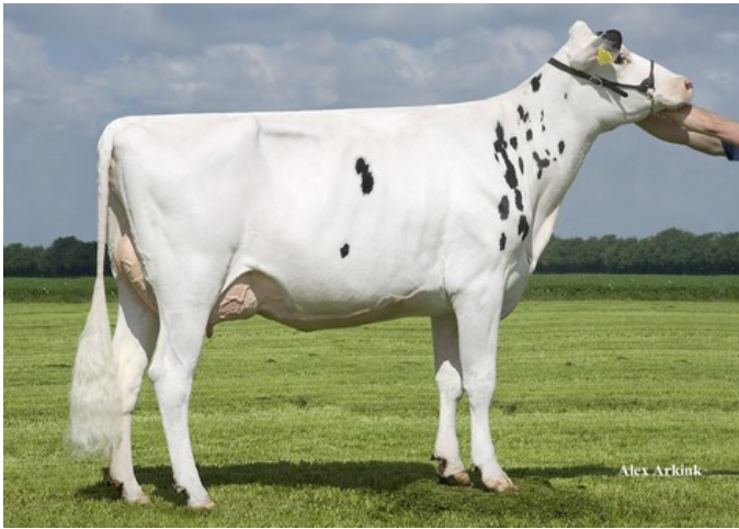
Holbra Lady Snow VG-88