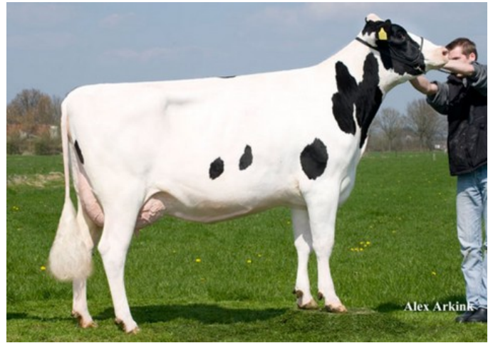
Holbra Paulona VG-85

VG-88 Adorable x Dozer x VG-85 Supersire x VG-88 Snowman x VG-85 Bolton x VG-87 O Man x EX-90 Morty x VG-88 Durham x EX-90 Rudolph x EX-95 Chief Mark