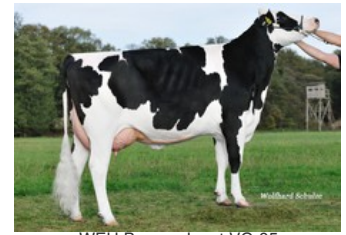
WEH Bronco Janet VG-85