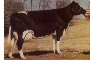
Rilara Mars Las Ravena EX-91

GP-80 King Royal x VG-86 Silver x VG-86 Supersire x VG-85 Bronco x VG-86 Jefferson x VG-88 Laudan x VG-87 Convincer x EX-90 Airliner x GP-84 Mountain x VG-86 Melwood