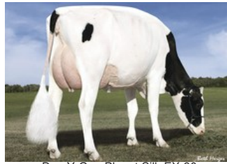
Des-Y-Gen Planet Silk EX-90