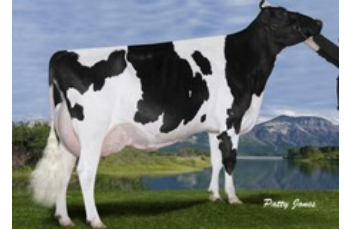
Gen-I-Beq Goldwyn Secret RC VG-87

VG-87 Styx Red x Rubicon x GP-83 Cashcoin x VG-87 Snowman x EX-90 Planet x VG-85 Bolton x VG-87 Goldwyn x VG-87 Durham x VG-86 Formation x VG-88 Aerostar