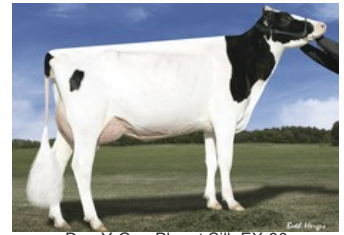
Des-Y-Gen Planet Silk EX-90