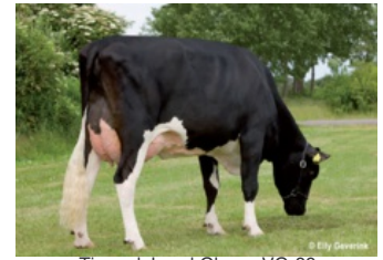
Tirs vad Juwel Ghana VG-88