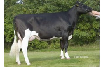
Tirs vad OMan Geneve VG-86

GP-83 Adorable x GP-84 Cinema x VG-86 Shotglass x VG-85 Beacon x VG-88 Juwel x VG-86 O Man x VG-87 Aaron x EX-91 Esquimau x VG-89 Lucky Leo x Scotty