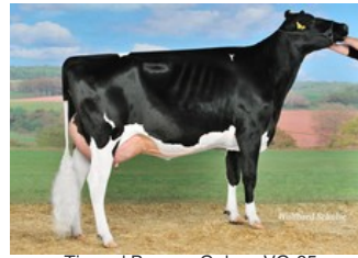
Tirs vad Beacon Galaxy VG-85