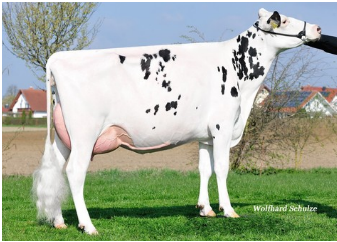
SPH Gallerie VG-86