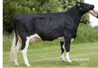
Tirs vad Juwel Ghana VG-88