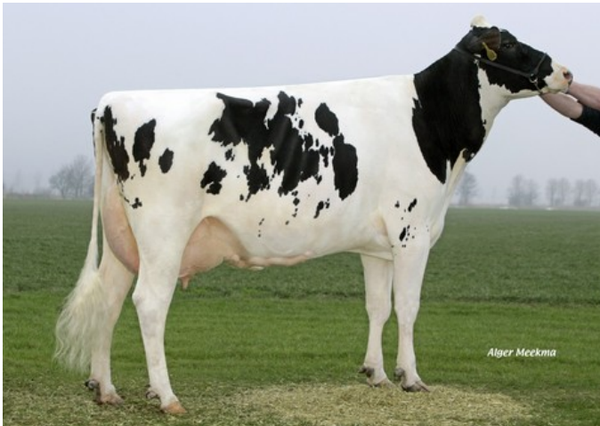
Koepon Shot Classy 17 VG-85