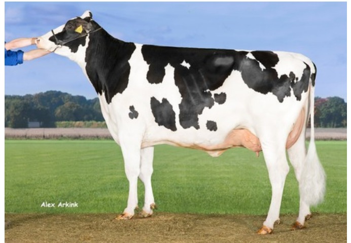
Koepon Oak Classy 4672 GP-83

VG-85 Imax x Silver x GP-83 AltaOak x VG-85 Man-O-Man x VG-85 Shottle x VG-86 Simon x VG-86 Merrill x VG-88 Bell Elton x VG-87 Rotate x VG-88 Wayne