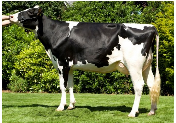
Giessen Cinderella 22 VG-85

VG-87 Bandares x VG-86 Kingboy x VG-87 Snowman x VG-85 Bolton x EX-91 Shottle x VG-89 Durham x EX-92 Encore x VG-88 Mark Cinder x EX-96 Tony x EX-94 Triple Threat