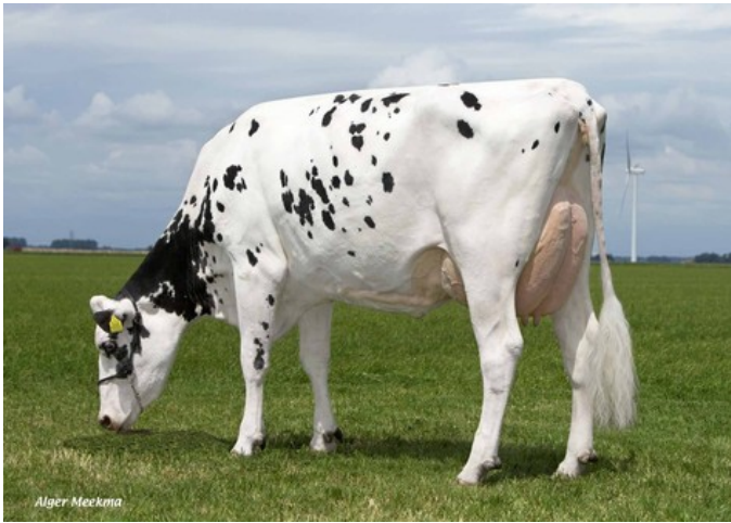
Giessen Snowman Cinderella VG-87