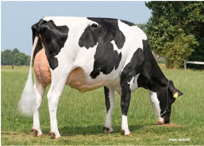
Holbra Malon 9 VG-88