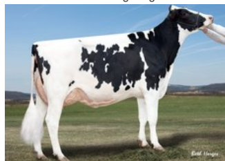
Gold-N-Oaks Arabell 1765 VG-88, Ramos