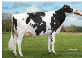
Tirsvad K&L Riveting Magnolia GP-84