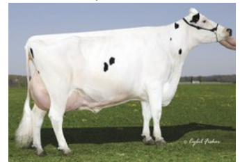
Gold-N-Oaks Morty Malibu EX-94

Real Syn x VG-85 AltaAlanzo x GP-84 Riveting x EX-91 Superhero x Silver x GP-82 Supersire x VG-87 Bookem x VG-88 Man-O-Man x VG-89 Shottle x EX-94 Morty