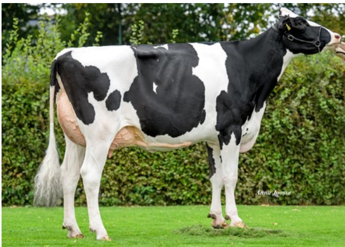
3STAR RM Martine VG-85

3STAR RM MADELIEF NL 646490917 DOB 18-08-2024