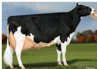
Blondin Goldwyn Subliminale EX-97