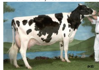
Blondin Skychief Supra EX-93

EX-90 Raptor x EX-97 Goldwyn x EX-93 Red Marker x EX-90 James x EX-93 Skychief x VG-87 Starbuck x VG-87 Warden x VG-85 Tempo x VG-85 Perseus Mark x EX Angelo