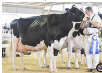
Blondin Goldwyn Subliminale EX-97