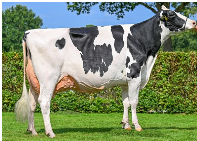
Blondin Success EX-90

BLONDIN SUCCESS DE 362022655 DOB 12-08-2019