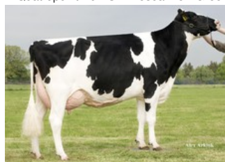
Holbra Mascol Pam VG-87