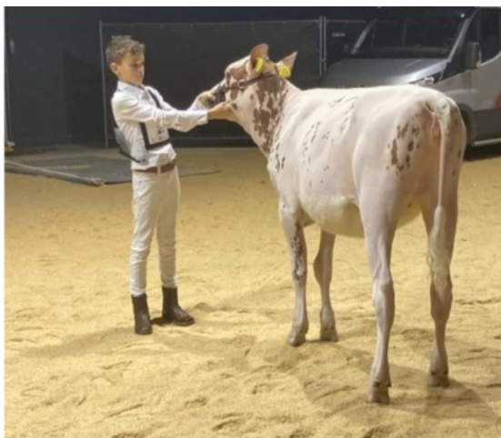
De Wijde Blick Roseanne Red 2