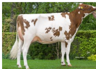
Quatropoint K&L SW Roseanne VG-85