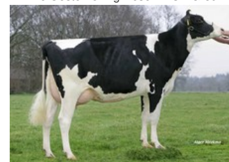
Holbra Manoa VG-85

Freestyle-Red x VG-85 Swingman Red x VG-89 Rubicon x GP-83 Aikman RDC x VG-85 Man-O-Man x VG-87 Mascol x VG-88 Durham x EX-90 Rudolph x EX-95 Chief Mark x EX-91 Sexation