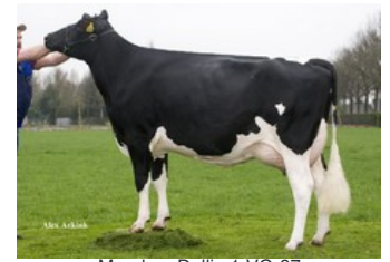
Manders Dellia 1 VG-87