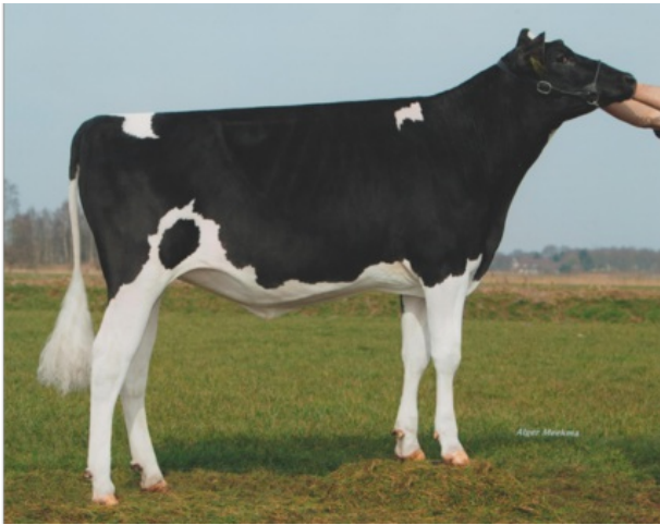
Van de Peelsehoeve Dellia 12 GP-84