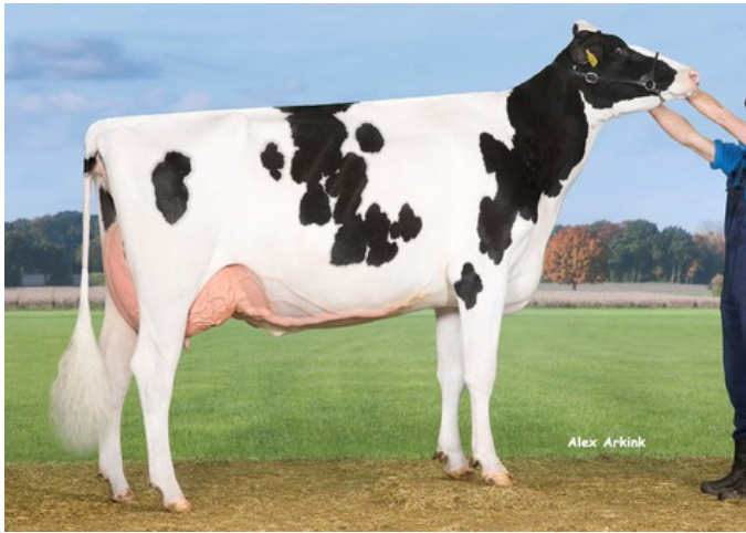
Drouner K&L Aiko 1398 RDC VG-89