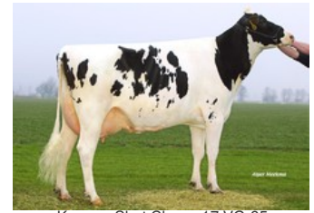
Koepon Shot Classy 17 VG-85