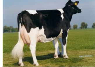
Koepon Classy VG-86