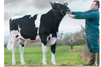
Same family: Cogent Supershot

Enclave x GP-82 Brave x GP-82 Soundcloud x GP-83 Imax x Silver x GP-83 AltaOak x VG-85 Man-O-Man x VG-85 Shottle x VG-86 Simon x VG-86 Merrill