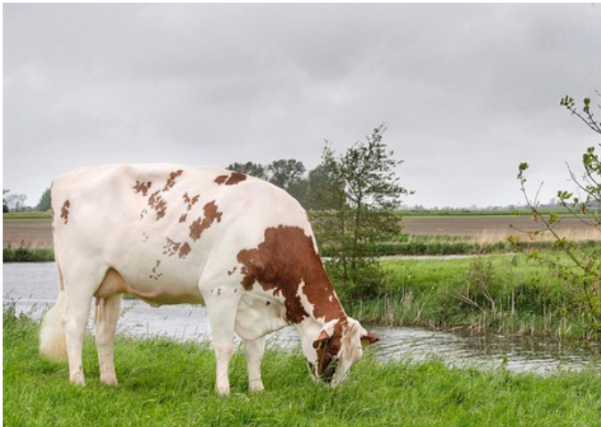
Lakeside Ups Red Range VG-86