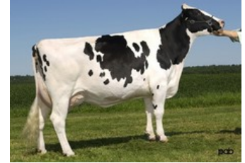
Glen Drummond Splendor VG-86

Tricky Red x Star P RDC x Rubels-Red x GP-84 Salvatore Rc x Rubicon x GP-83 Cashcoin x VG-87 Snowman x EX-90 Planet x VG-85 Bolton x VG-87 Goldwyn