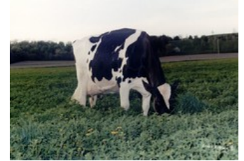
Golden-Oaks Mark Prudence EX-95

Tricky Red x Parfect x VG-87 Mark RDC x VG-86 Salvatore Rc x VG-89 Rubicon x GP-83 Aikman RDC x VG-85 Man-O-Man x VG-87 Mascol x VG-88 Durham x EX-90 Rudolph