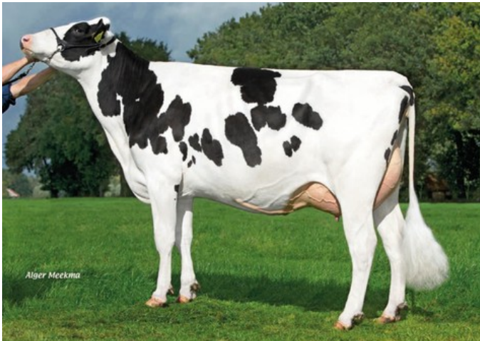
A-L-H Delta Modest VG-87