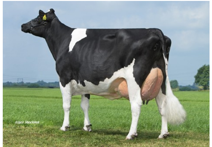
Poppe Fienchen 580 RDC VG-89

Mask Red x Star P RDC x VG-86 Match P RDC x VG-85 Rubi-Agronaut x VG-85 Apoll P Red x VG-86 Danillo x VG-89 Stol Joc x VG-85 Lightning RDC x GP-84 Konvoy x VG-85 BW Marshall