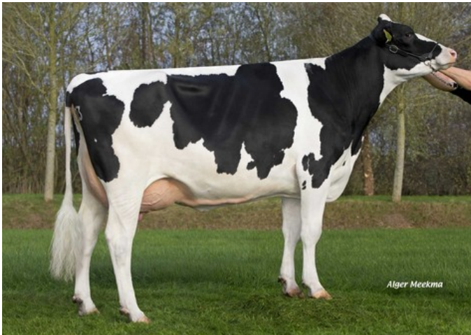
Poppe Fienchen 803 RDC VG-86