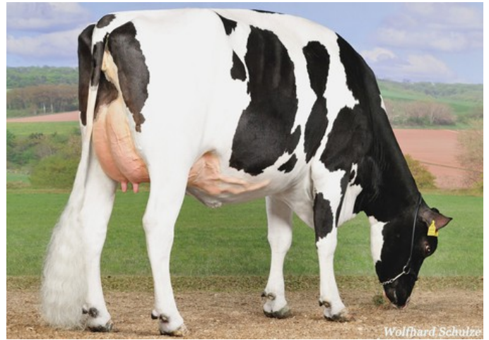
KNS Dalista VG-87

VG-87 Balisto x GP-84 Shamrock x VG-85 Man-O-Man x EX-91 Goldwyn x EX-90 Lee x EX-93 Integrity x VG-85 Prelude