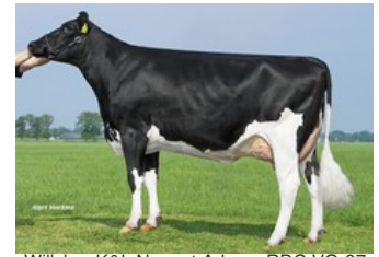
Willsbro K&L Nugget Aderyn RDC VG-87