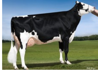
KHW Super Aderyn RC EX-90