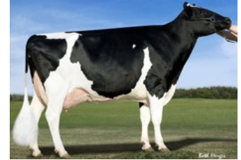
KHW Goldwyn Aiko RDC EX-91

AltaRefine-Red x VG-87 Rubels-Red x VG-89 Salvatore Rc x VG-87 Nugget RDC x VG-85 Supersire x EX-90 Superstition x EX-91 Goldwyn x EX-95 Durham x EX-93 Prelude x EX-94 Jubilant RF