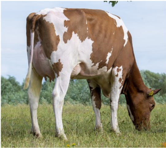
3STAR Visstein Adola Red VG-87