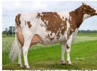
Visstein K&L SV Aderina Red VG-89