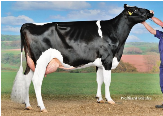
WKM Ronja VG-85