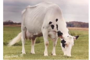
D-R-A August EX-96

Ridercup x VG-86 Rubels-Red x VG-89 Salvatore Rc x VG-87 Nugget RDC x VG-85 Supersire x EX-90 Superstition x EX-91 Goldwyn x EX-95 Durham x EX-93 Prelude x EX-94 Jubilant RF