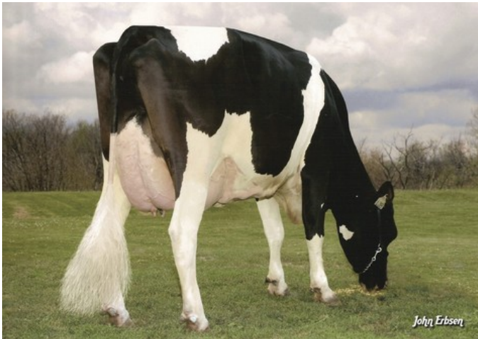
De-Su BW Marshal Georgia EX-90