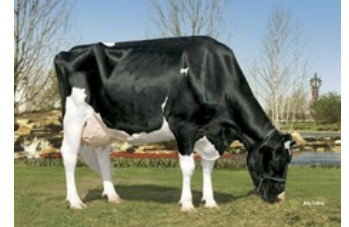
Kamps-Hollow Durham Altitude EX-95

Freestyle-Red x VG-85 Swingman Red x Alaska Red x VG-85 Salsa RC x VG-87 Supersire x VG-85 Alexander x EX-91 Goldwyn x EX-95 Durham x EX-93 Prelude x EX-94 Jubilant RF