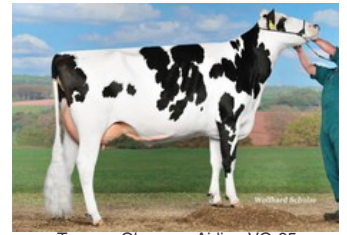
Teemar Observer Airline VG-85