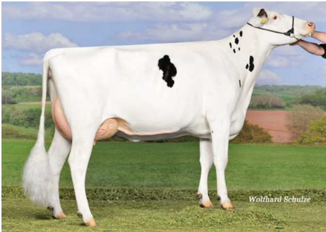
Aida RDC VG-86