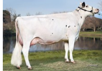
Teemar Shottle Aloha VG-88