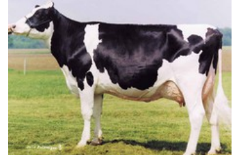
Dixie-Lee Aspen EX-92

Sinan PP x VG-86 Solitair P Red x VG-85 Abi Red PP x VG-87 Powerball-P x VG-86 Snow RF x VG-85 Observer x VG-88 Shottle x VG-87 O Man x VG-86 BW Marshall x VG-85 Tesk Terry