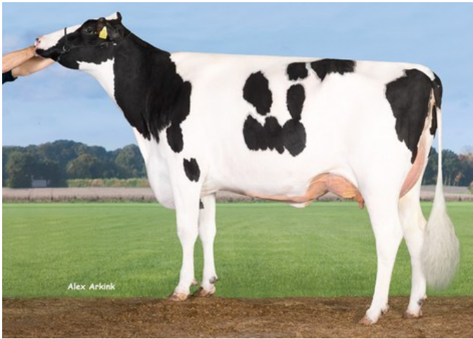
Tirs vad Sniper Gambia VG-89