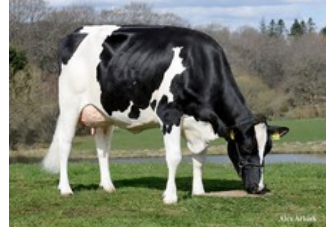
Tirs vad Limbo Gatsby VG-88