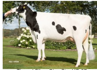
Tirs vad Silver Giga-Star VG-87