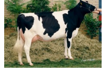
Grietje 80 EX-91

AltaZazzle x Charl x VG-89 Sniper x VG-87 Silver x VG-87 Massey x VG-88 Limbo x VG-86 Stol Joc x VG-86 O Man x VG-87 Aaron x EX-91 Esquimau