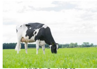
KHE I'm Good VG-87