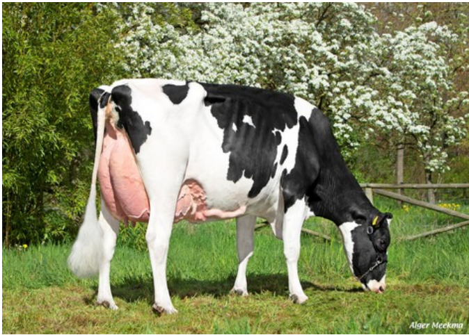
KHE I'm Good VG-87